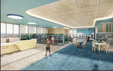
Knob Hill Elementary School Nominated by: DLR Group GroundLevel MA Engineers RTM Engineering Consultants San Marcos Unified School District SWS Engineering