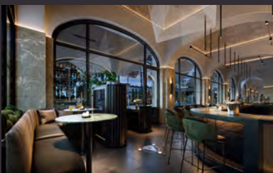
Teatro Angelina Nominated by: VANROOY design Clay Enterprises Green MEP Engineering Consulting, Inc. VMC Architecture