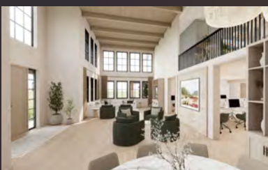
Together Freedom Nominated by: ONE NINE Architecture Icon Engineering ONE Maple ONE NINE for Humanity