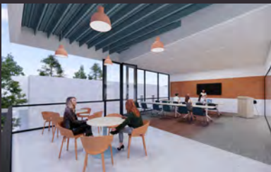
Southland Credit Union Branch & Office Nominated by: Worksmart Design Brandow & Johnston ESI One Electric